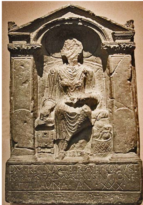
Figure 2. Tombstone of Regina, Great North Museum, Newcastle-upon-Tyne (RIB 1065).

One of the best-known Roman funerary monuments in Britain comes from Arbeia (South Shields), the easternmost fort on Hadrian’s Wall (Fig. 2). This monument was commissioned by Barates of Palmyra in memory of his wife, Regina. The Syrian-born Barates is of course a fine example of the voluntary Roman migrant: but what of Regina?