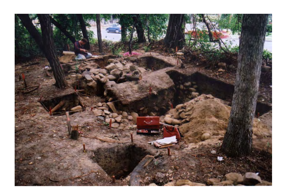
Figure 1. Excavations at the Betsey Prince site.

The house contained two rooms: a main room which measured roughly 3.35 by 4 meters (11x13 feet), and a 1.8 by 2.45 meter (6x8 foot) kitchen wing with fireplace located west of the main room (LoRusso 1998:70; Fig. 2). The construction of the kitchen wing was contemporaneous with the remainder of the house. The house foundation and chimney base