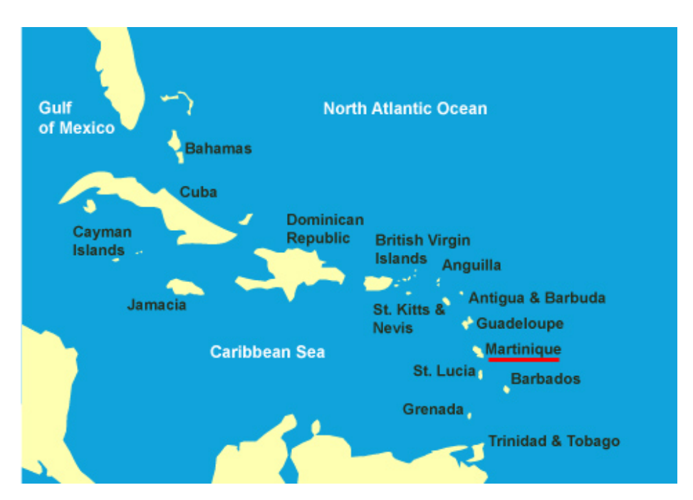
Figure 1. Location of Martinique in French West Indies region.

Data recovered during archaeological research at the former sugar plantation Crève Cœur on Martinique (Figure 1) provides the opportunity to study the lives of the enslaved population and the planters in relation to one another. For the purpose of this study a portion of the ceramic assemblage from an area within the slave village (Locus A) and a portion of the assemblage recovered from the midden by the Maison du Maitre (Locus M) will be compared using a variety of techniques. This study provides us with information that can be applied and contrasted with other sites throughout the French West Indies and then within the wider scope of the New World.