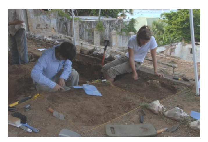
Figure 2. Excavation in progress at the Magens House compound.

This "hole" on the side of the hill is the house compound of the former Magens House. The Magens House is now the site of intensive archaeological and historical research by Syracuse University that is exploring the complexity of life in the nineteenth century port town of Charlotte Amalie (Figure 2). This site is being used to tell the story of life of all of those who lived in the households associated with this compound. The property contains the ruins of the Magens House, which was destroyed by hurricane Marilyn in 1995, along with intact outbuildings including a cook house and slave/servant quarters and two houses that were once occupied by clerks and other mid-level clerks and managers. Unlike many properties in the