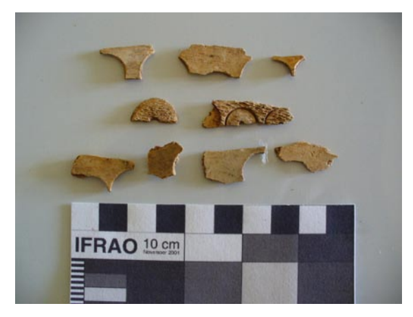
Figure 4. Bone button blanks from the cottage industry manufacture of bone buttons on the site, recovered from middens behind and upslope from the laborer quarters at the Magens House site.

The Magens House compound presents a unique opportunity to examine social complexity in a nineteenth century house compound in a port town of the Caribbean. It provides a site-based case study that provides details on local lifeways, but which at the same time sheds light on regional and global interactions expressed in a port-town setting. Those who came to Charlotte Amalie and lived at this site hailed from diverse places including Copenhagen, Glasgow, Paris, Boston, Philadelphia, the Canary Islands, and from an array of Caribbean islands spanning the region and its colonial polities, from Puerto Rico to Barbados. Many were descendents of people from many nations of Africa whose presence was initially coerced via the slave trade. All of these people arrived at this residence, on an island that was at once marginal, but at the same time a center of global trade and interaction. Such is the nature of a nineteenth century Caribbean port town and the multi-scalar social and economic infrastructures of which it is a part.