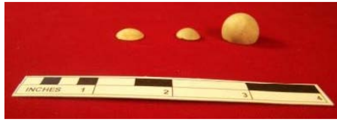
Figures 11 and 12