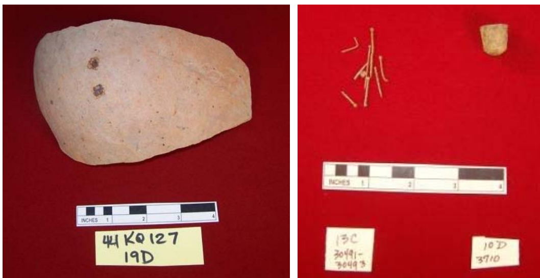
Figures 4 and 5

In addition to an abundance of classic eighteenth century imported ceramics, there was a large colonoware pot sherd, which was excavated from the external kitchen trash pit (Fig. 4). The presence within the kitchen, where pots and pans were readily furnished from the white residents, shows the representation of Black culture within a white space. Whether this colonoware pot was made on the plantation, or given to the cook as a gift from the quarter folk, is debatable. However, its context, as an African derived cooking vessel, locally made by enslaved Africans, shows that the cook, while living in a white landscape, flavored his or her space with material that represented their heritage.