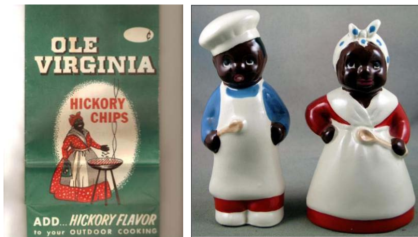
Figure 1. Stereotypes in material culture (all images by author).

While slavery ended over 150 years ago, its legacy permeates our social, cognitive and material worlds. Boxes of Aunt Jemima Pancake mix and Uncle Ben's Rice stock our grocers' shelves, while using the image of enslaved cooks to authenticate their products (Fig. 1). This mythical cook is so engrained in America's culture and consciousness that we have neglected to interrogate this widely accepted memory. My dissertation redefines the mythical "slave cook" and has uncovered their rich and complex history and role in plantation culture. Archaeological data is critical in re-informing contemporary mythical ideas about enslaved cooks and their kitchens, and helps reshape their legacy in America's cultural history.