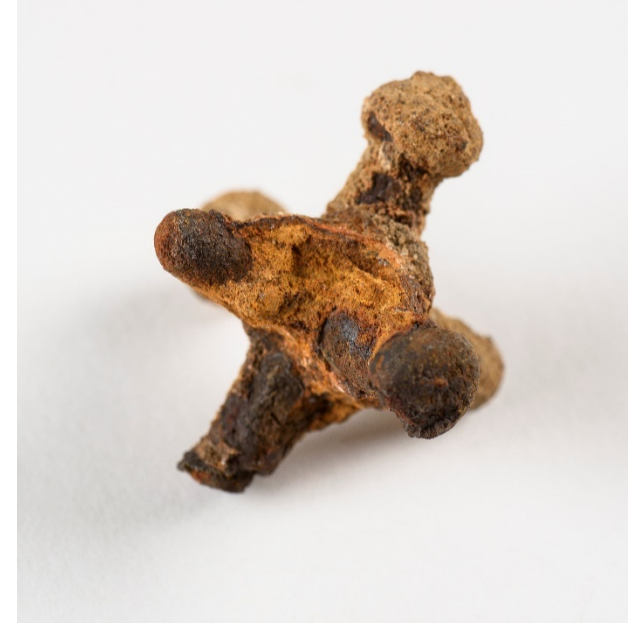
Iron jack found in the basement of 1315 Duke Street (44AX75, Unit XVI, Level C)

is also committed to interpreting the history of the domestic slave trade beyond the walls of the museum. Alexandria Archaeology recently developed and installed a new sign in the heart of Waterfront Park that links 1315 Duke Street to the wharves along the Potomac River where enslaved people forcibly boarded ships bound for New Orleans.