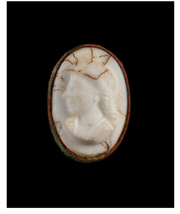
Cameo found in the basement of 1315 Duke Street (44AX75, Feature 1, Level E)

Though the Freedom House Museum has reopened, work and research are not complete. The Office of Historic Alexandria is currently engaging with the community and other stakeholders to create the Master Plan for the museum. The Master Plan will provide a road map for the future use, interpretation, and preservation of the site. Through a series of public meetings and survey, feedback will be solicited about the site's mission, name, interpretive focus, and role in the community (https://www.alexandriava.gov/museums/master-plan-freedom-housemuseum).The first series of stakeholder meetings began in March 2023. The City of Alexandria