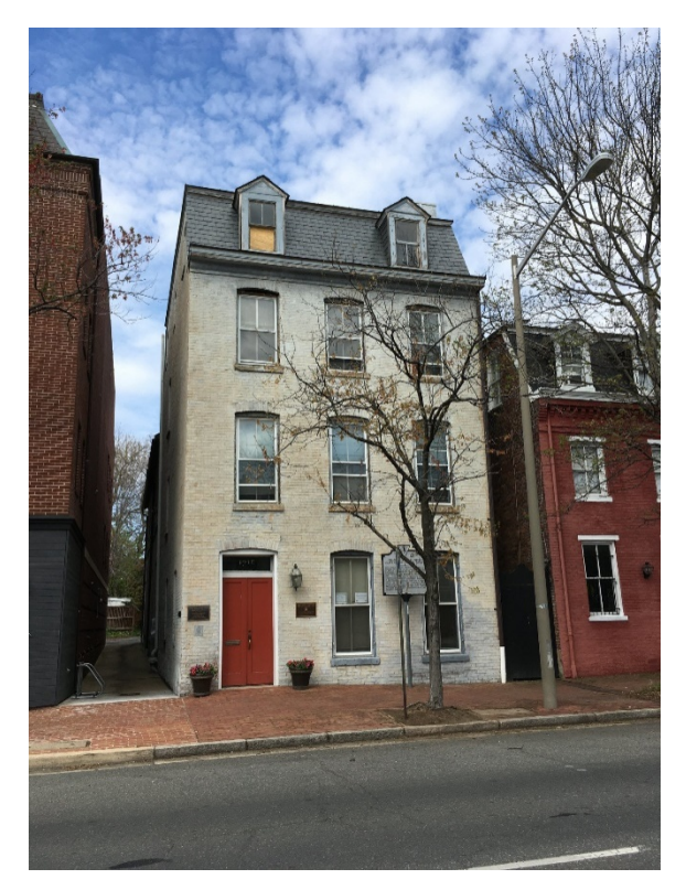
1315 Duke Street

1315, and the west men's yard at 1317 Duke Street. Archaeologists uncovered artifacts and features, such as evidence of foundations and posts, which tell us more about the lives of those imprisoned here, awaiting sale and transport south.